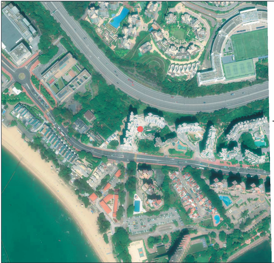
● Location of the Phase 期數的位置